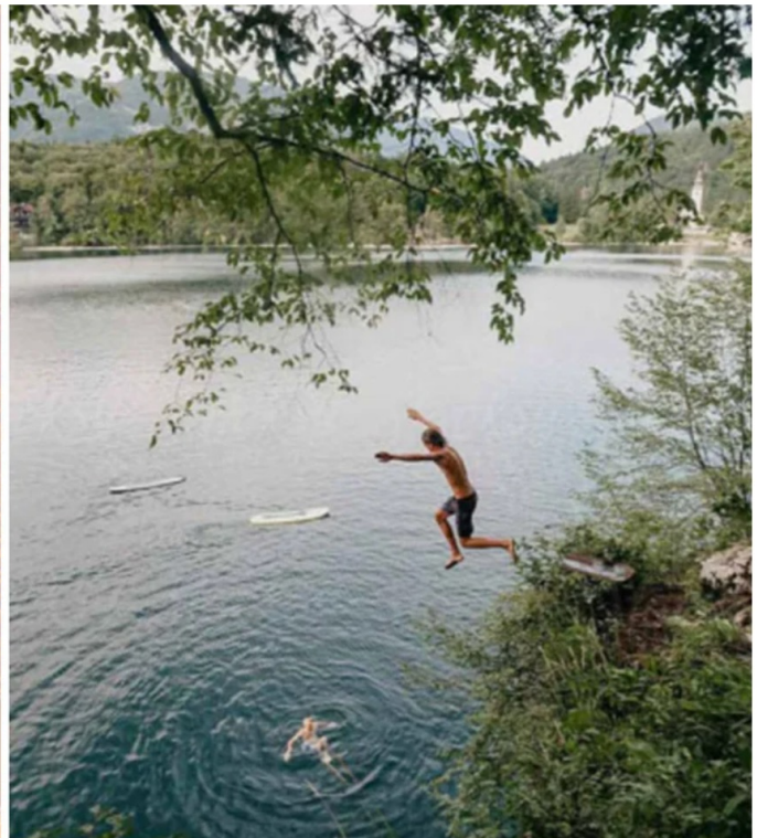
Among the many amenities on property: a music studio and watering hole.