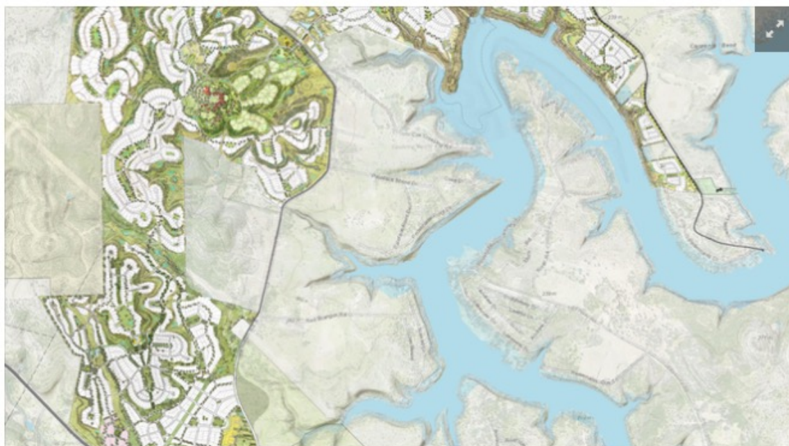
This map of Thomas Ranch was released in December 2022. Plans for the community's layout have since changed, but this older image provides an idea of the vast scope of Thomas Ranch.

The golf campus will also include a clubhouse and restaurant, wellness facility, pickleball courts and a boutique hotel. Developers have also indicated they would like other commercial uses, including possibly a grocery store.