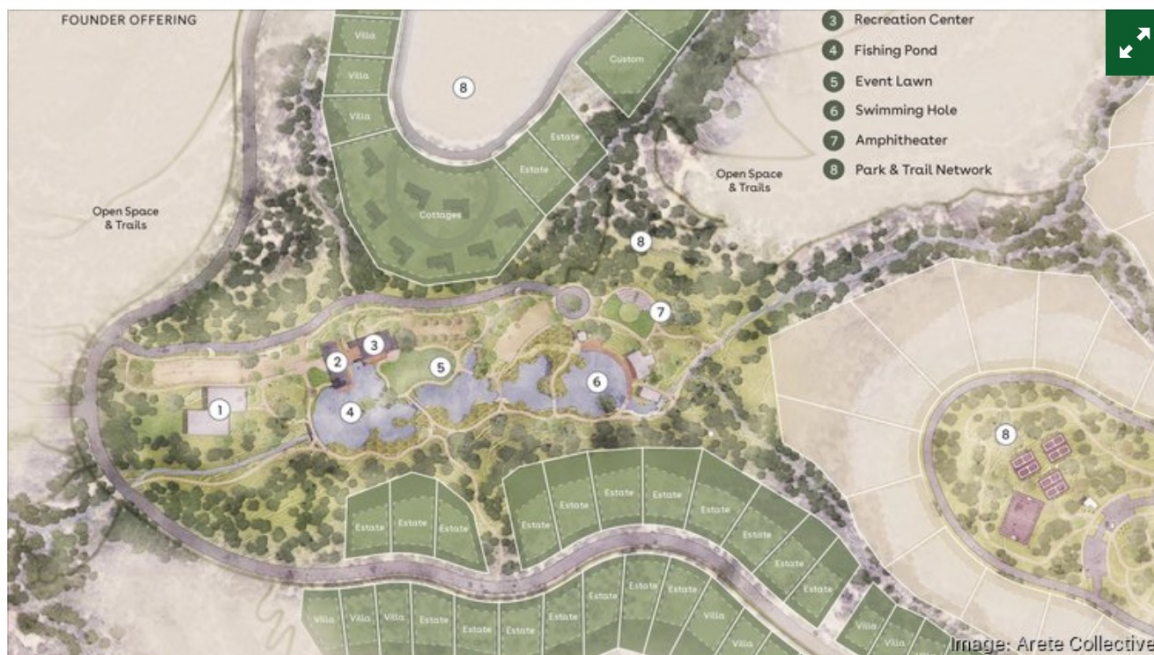
Loraloma represents the first phase of construction on the 2,200-acre Thomas Ranch.